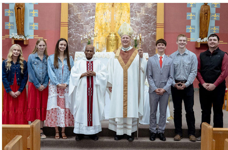
Confirmation, St. Agnes, Grainfield — April 12.