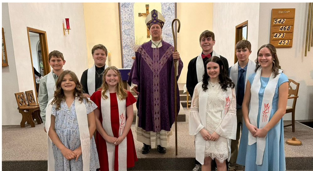
Confirmation, Sacred Heart, Selden — March 7