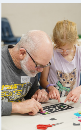
STORY ON PAGE 6

• Join the Register in reflecting on Pope Leo XIV's first year, including actions and statements. Page 10