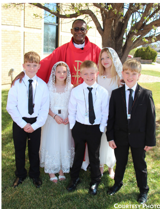
First Holy Communion, Christ the King, WaKeeney, March 28