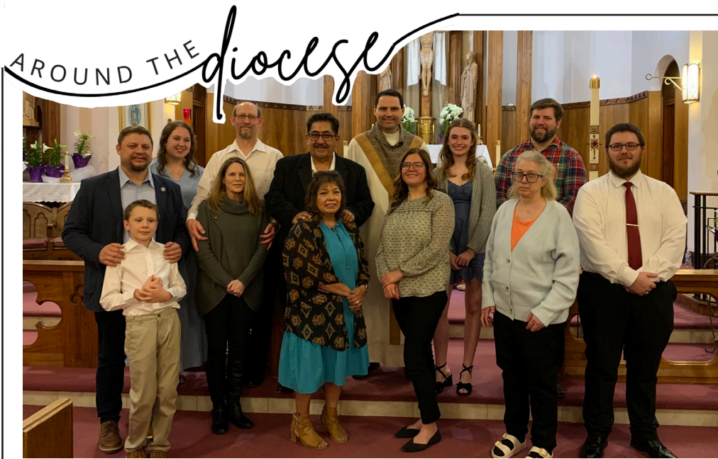
OCIA members celebrate Easter at St. Andrew's, Abilene.