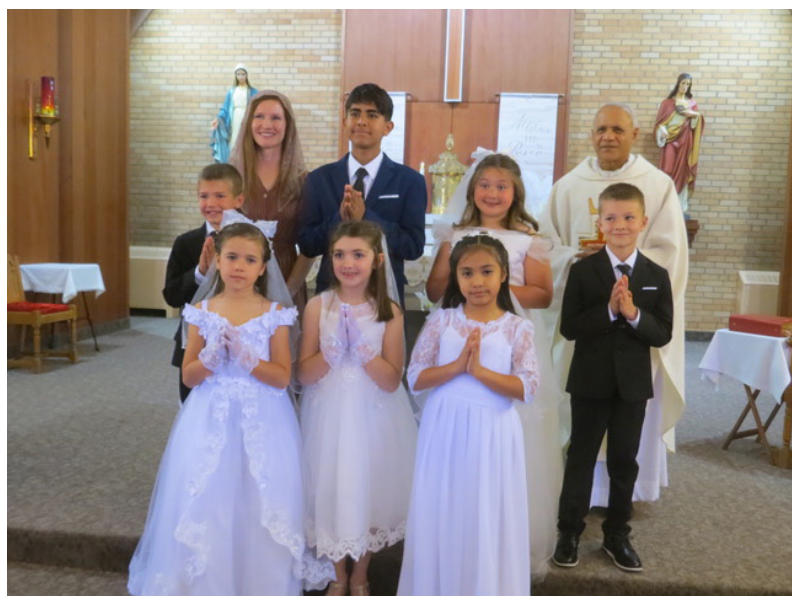
First Holy Communion, Sacred Heart, Oberlin — April 12.