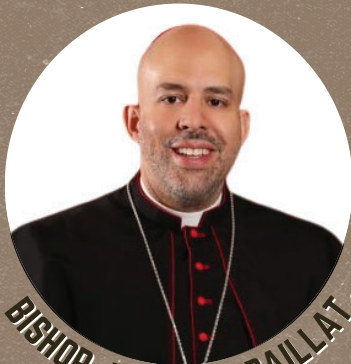
BISHOP JOSEPH ESPALLAT