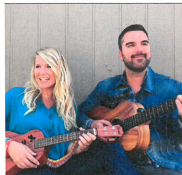
MUSIC BY ALL THINGS I AM