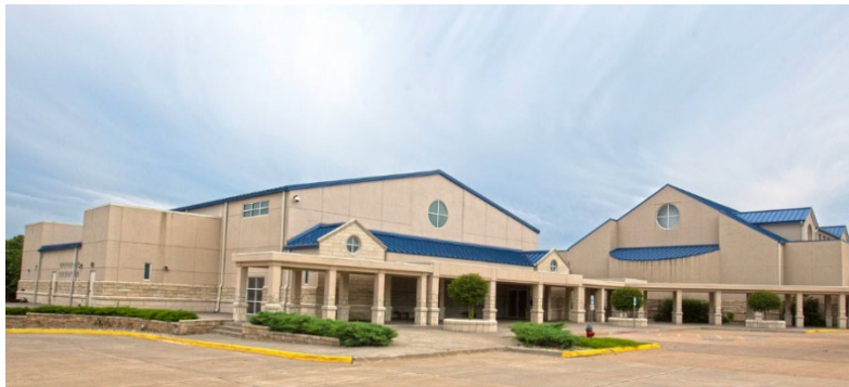
(Parish Center behind the church)