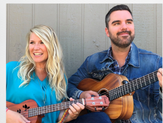
MUSIC BY ALL THINGS I AM