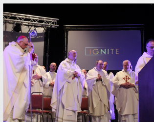
MASS WITH THE BISHOPS OF KANSAS