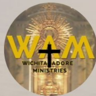
Wichita Adore Ministries