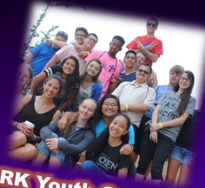
SPARK Youth Group Choir St. Francis Xavier Parish