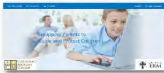
A New Online Learning Tool Brought to You by Catholic Mutual Group